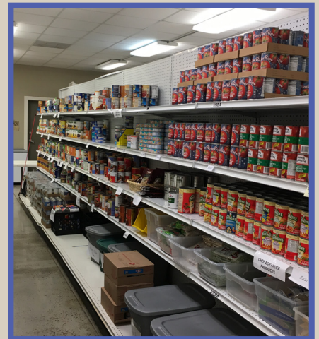
Deep Well pantry

Our Wellness Pantry, The Children's Center, Hardeeville and Ridgeland Elementary schools, and other area food pantry partners