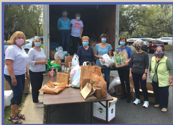
Community volunteers collecting and sorting donations

275 & 234 # of Thanksgiving and Christmas Dinners coordinated and delivered 724 # of children who received toys and new clothing from the Santa Shop 161 # of new bicycles the Santa Shop gave to local children